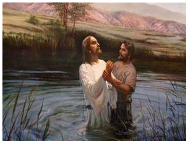
JOHN THE BAPTIST BAPTIZING JESUS