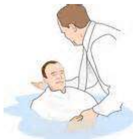
BAPTIZED IN A BAPTISTRY IN CHURCH