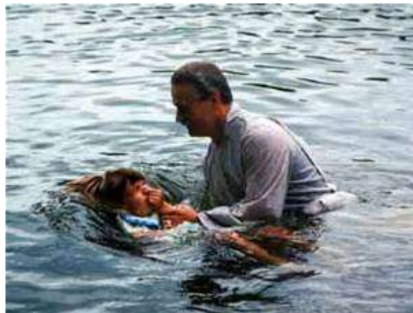
BAPTISM IN RIVER

Know that joining the church and baptism do not save Additional Visuals